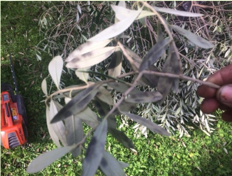
Grey mould - Cercospora